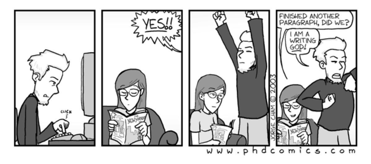
Figure 2.2: A Thesis Writing Comic (from www.phdcomics.com).

keyword — Used to highlight keywords. For example, this is somekeyword (the command that produces this output is \keyword{somekeyword}).