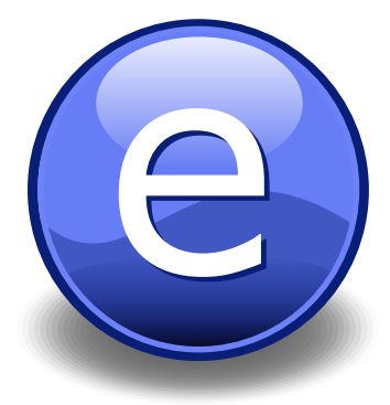
Figure 2.1: An electron (artist's impression).

There are some additional commands created to keep the formatting separated from the content, which we document below.