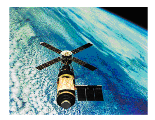
Fig 3 This satellite is a still image from Video 1 (Video 1, MPEG, 2.5 MB).