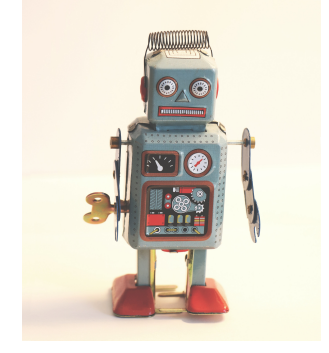
(b) This another robot.