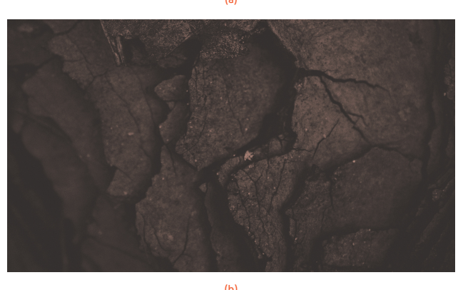
FIGURE 3. An example of a figure with two subfigures, one appearing above the other. This type of figure is appropriate for combining multiple figures that present similar content or data. (a) First subfigure; (b) second subfigure.