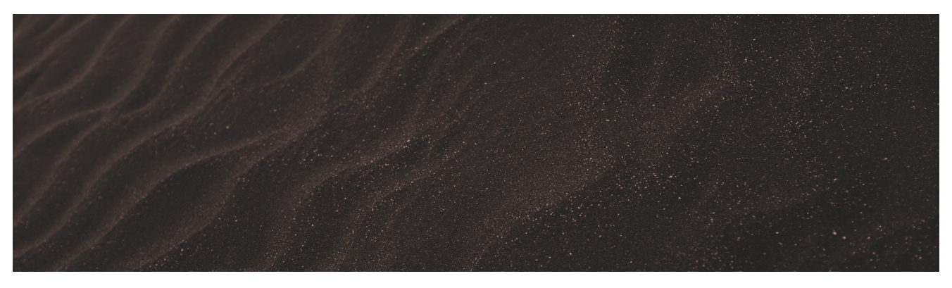
FIGURE 2. And example double-column figure. Charts, illustrations, and other images that are wider than they are tall might be more readable as double-column figures, whereas tall images will likely take up too much page space.