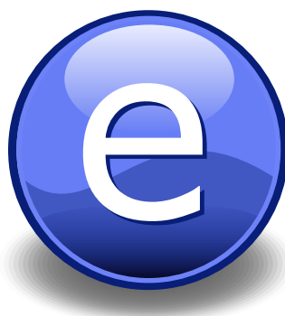
Figure 2.1: An electron (artist's impression).

There are some additional commands created to keep the formatting separated from the content, which we document below.