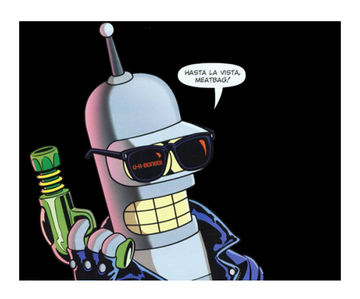
Figure 1: Concept art for Killer Robot prototype[4]