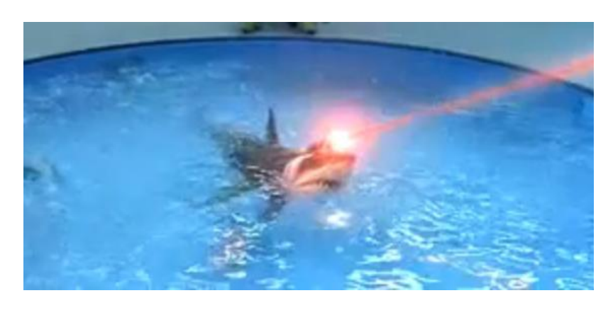
Figure 2: Example of a finished Shark Laser[6]