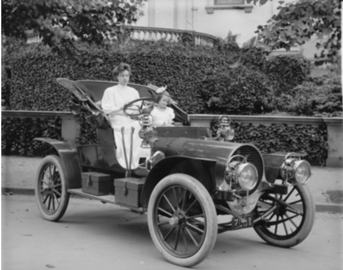
Figure 1: 1907 Franklin Model D roadster.

example, however we only output the series if the volume number is given [8] (so series should not be present since it has no vol. no.), a chapter in a divisible book [9], a chapter in a divisible book in a series [10], a multi-volume work as book [11], an article in a proceedings (of a conference, symposium, workshop for example) (paginated proceedings article) [12], a proceedings article with all possible elements [13], an example of an enumerated proceedings article [14], an informally published work [15], a doctoral dissertation [16], a master's thesis: [17], an online document / world wide web resource [18, 19, 20], a video game (Case 1) [21] and (Case 2) [22] and [23] and (Case 3) a patent [24], work accepted for publication [25], prolific author [26] and [27]. Other cites might contain 'duplicate' DOI and URLs (some SIAM articles) [28]. Multi-volume works as books [29] and [30]. A couple of citations with DOIs: [31, 28]. Online citations: [32, 18, 33, 34].