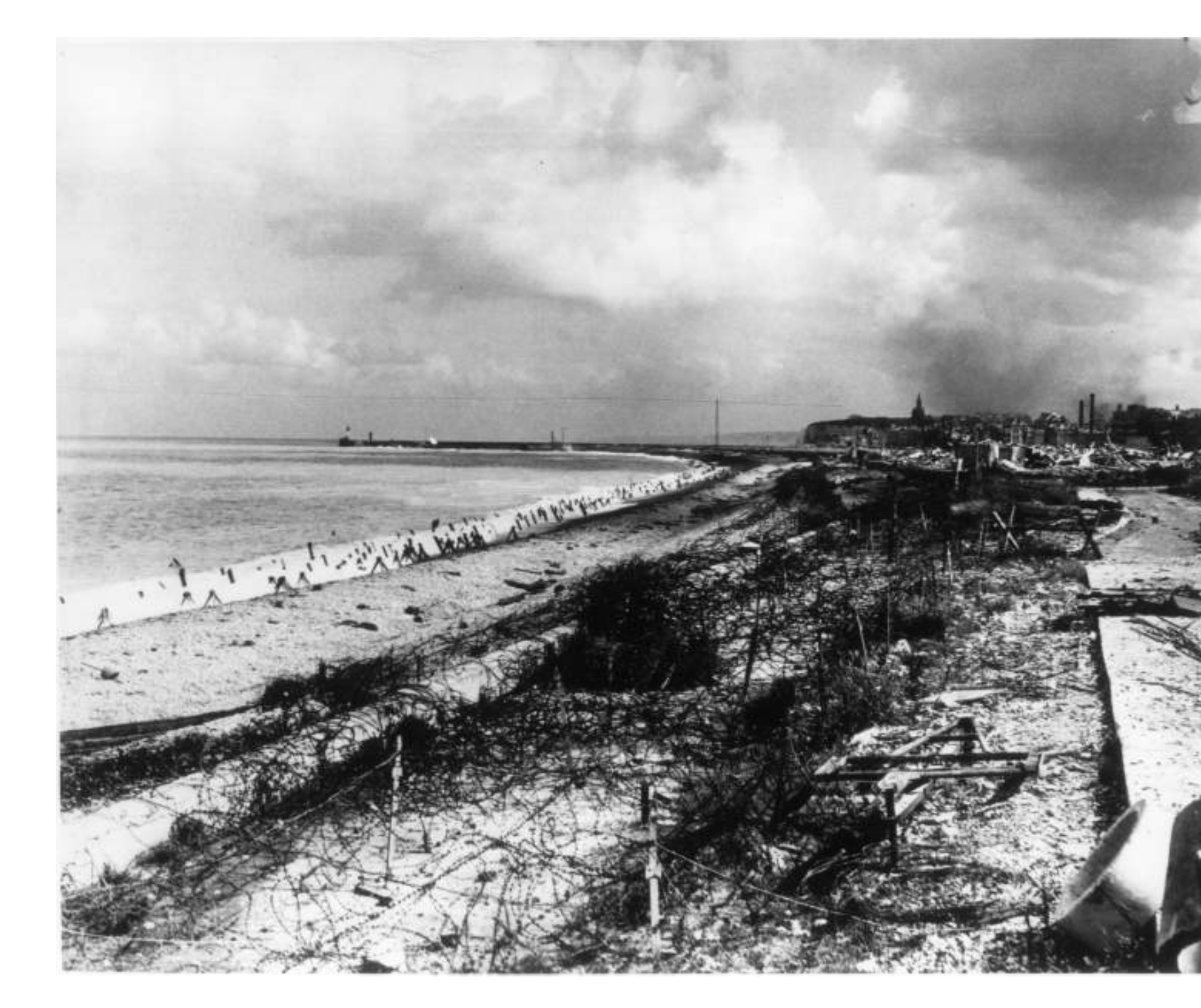
Figure 3: A destroyed beach after the assault

eration. No good came out of the raid other than the lessons learned which helped with future operations such as June 6th, 1944 known as D-day. The Military blamed slaughter of men due to lack of preparation in Dieppe and made plans to prepare for such things and take defended beaches more seriously. The lessons learned about how hard a defended beach really is to take helped saved many lives.