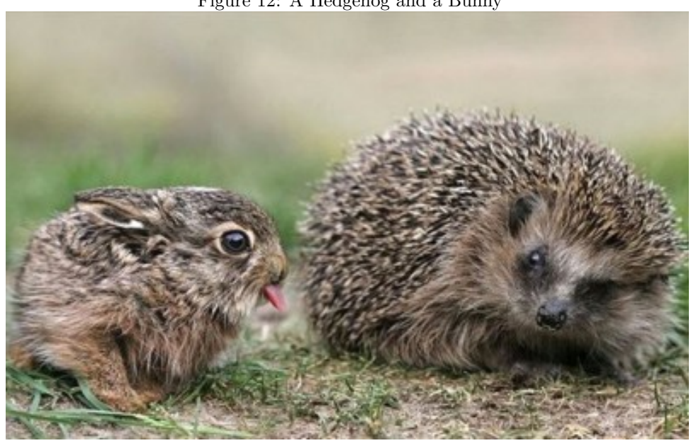
Figure 12: A Hedgehog and a Bunny

If not, I shall be very saddened, much like the individual in figure 13.