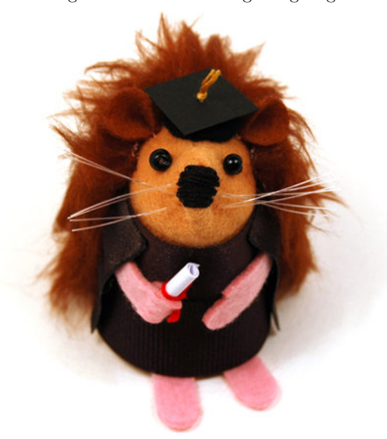
Figure 10: A Graduating Hedgehog

Furthermore, I wish him every success in his dissertation, so that he may be like the individual in figure 10, and he can party like the individual in figure 11.