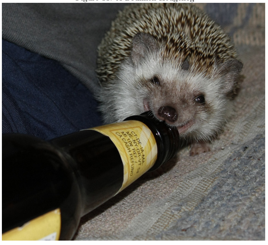
Figure 11: A Drunken Hedgehog